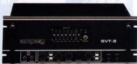
Ampeg SVT II