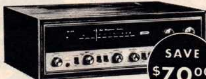
Shown in Wood Case

Ultra-sensitive. All solid-state. 65 semiconductors. Response: \pm 1 dB, 20–50,000 Hz. Power bandwidth 15–30,000 Hz. FM stereo separation: 35 dB. From Japan. With metal case. Shpg. wt. 28 lbs. 14 PG 5072 U. $10 Monthly..... 199.95 14 PG 5003X. Walnut Wood Case 6 lbs... 19.95