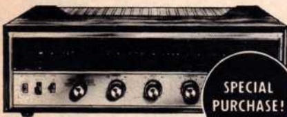
Shown in Wood Case

Big Allied savings on this famous Fisher model! Has field-effect front end, interstation muting, 3 limiters. 25–25,000 Hz. Image rejection 80 dB. Shpg. wt. 24 lbs. 13 PG 2078 U. $13 Monthly..... 249.99 13 PG 2629X. Walnut Wood Case 6 lbs... 22.45