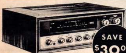
Shown in Wood Case

Great performance... and great savings! Solid-state receiver has full response ( \pm 1 dB, 20–30,000 Hz), 3 dual IF stages, 2 limiters, Schmidt automatic stereo FM switching. With metal case. Allied 919 turntable with cuing control, low mass arm, Empire 808E cartridge. Allied 3030B speakers have 12" woofer, 6" midrange, 3½" tweeter in 14½x24x9" walnut cabinet. Shpg. wt. 85 lbs. 14 PG 0134 D5U. $14 Monthly..... 279.95 14 PG 5003X. Walnut Wood Case. 6 lbs..... 19.95