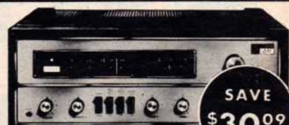
Shown in Wood Case

Amazing power—and amazing savings! Has new flip switches, 4 dual tuned IF stages, two limiters, 82 semiconductors. Response: \pm 1 dB, 18–60,000 Hz. With metal case. From Japan. Shpg. wt. 30 lbs. 14 PG 5070 U. $12 Monthly..... 229.95 14 PG 5003X. Walnut Wood Case 6 lbs... 19.95