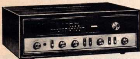
Shown in Optional Wood Case

45 watts music power; 90 watts peak power! Includes cables, instructions—ready to put together and play!